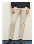
NEOBLU GUSTAVE WOMEN 03179