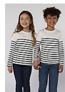
SOL'S MATELOT LSL KIDS 03101